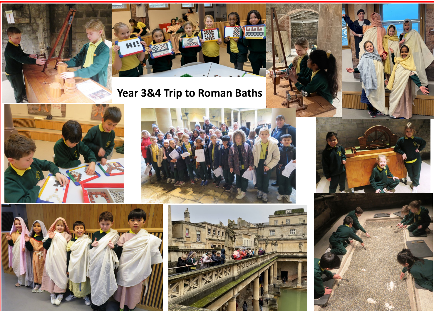
Year 3&4 Trip to Roman Baths

If you do keep your child at home, it's important to phone us and let us know that your child won't be in and give us a clear reason. As part of our absence management policy please also expect check in calls from us subsequent to this.